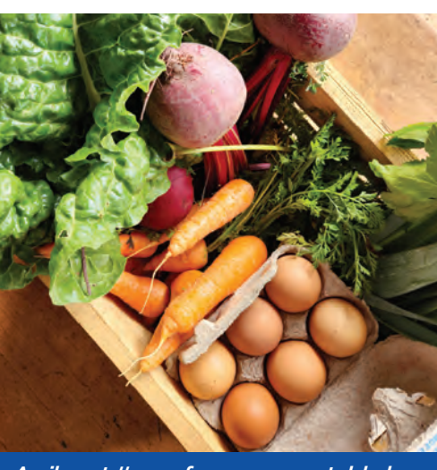
A vibrant #growformore vegetable box before being delivered