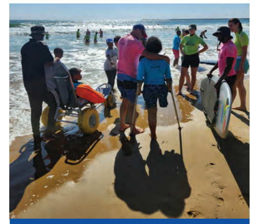
Surf Therapy session heading into the water