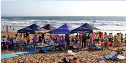
The set up at the AIRE-ZA KZN Para Surfing Champs