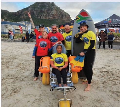
The Prone All Inclusive ladies with their amazing and selfless coaches