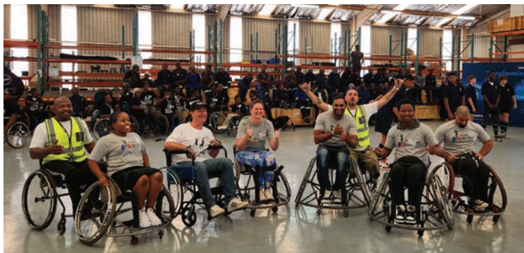
Team Made for More and Mac Steel at the SBS Wheelchair Challenge basketball match