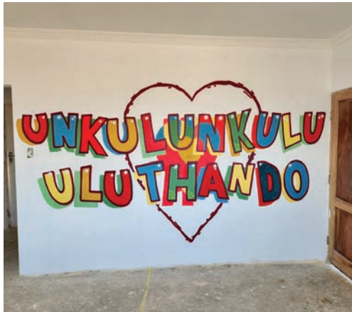
The mural on the entrance wall at the top of the Amahlongwa Building

Thanks to Vopak who helped with a Mandela Day activation, we have the finance to finish the top floor of the Amahlongwa Build while adding a bit of fun and colour to our space. With their contributions, we were able to get ceilings, skim the walls, paint, do tiling and make the entrance accessible. We have some final touches to do including a toilet, basin and some plumbing and electrics. We are always blown away by the help and generosity of Shisamanzi who are always willing to assist with our electrical needs.