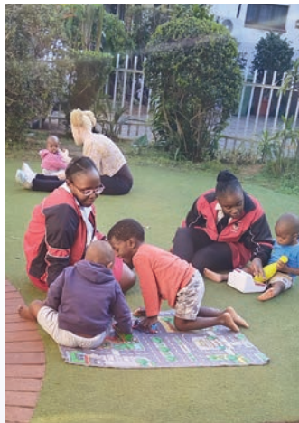
Some of our bible studies girls connecting with the children at Ithemba Lethu

Boccia, Exercise Therapy and Bible Studies have been continuing as per normal with continued engagement and impact. A highlight was when 6 of the Bible Studies boys gave their lives to Jesus in March and have since been on a beautiful journey of deepening their faith. A highlight for the girl's group, was the community project in which we visited one of the local orphanages. Before the event, the youth raised funds to buy items that were needed for the home and they then spent time on the day helping the house mothers feed, change, bath, dress and play with the kids. The house mothers educated them on teenage pregnancy and processes to follow when in an abusive home or relationship. Snolwazi summed up how empowered she felt after the community project by saying; "It feels great to serve as we are the ones always being served"