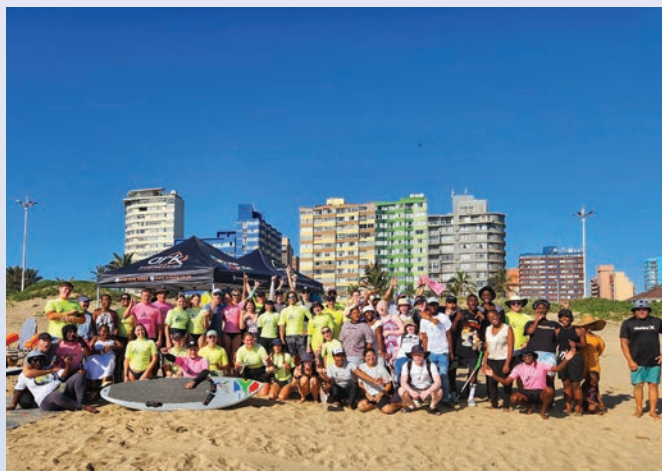
What a Surf Therapy Day looks like!

Our Surf Therapy and Para Surfing programmes have been going beautifully, and they are always full, with surfers needing to go on the waiting list, almost every session - a good problem to have. We have been blessed with life-jackets and helmets for increasing safety thanks to Hewitt and Associates, and we look forward to fine-tuning a safety video for our volunteers and water assists going forward. We have also been included in two able-bodied surf events, including the Cutty Sark Pro in Scottburgh and the prestigious Ballito Pro, making history in more ways than one.