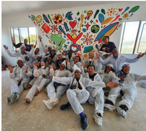
Mandela Day in Amahlongwa with the wonderful team at Vopak